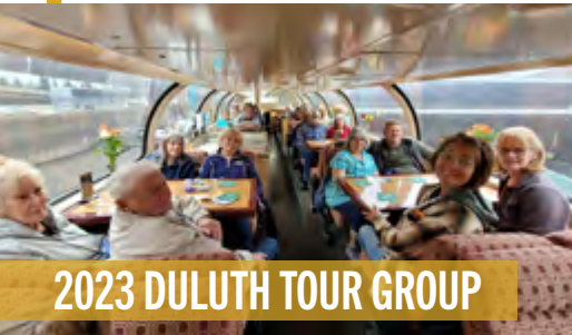
2023 DULUTH TOUR GROUP

Please note that most attractions will require active participation and walking!