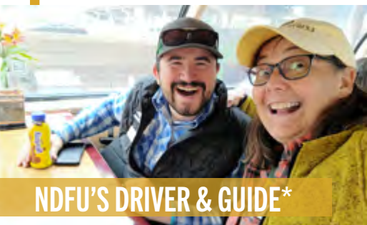
NDFU'S DRIVER & GUIDE*

Return this form and your $100 deposit per person to the mailing address below: