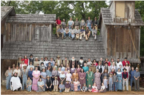
SHEPHERD OF THE HILLS OUTDOOR THEATER