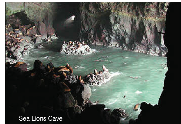
Sea Lions Cave

Our drivers are experienced and have CPR, AED and First Aid certification.